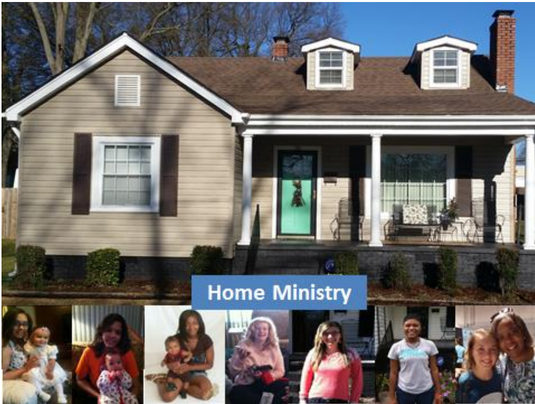
Brought 22 girls with six children into our home