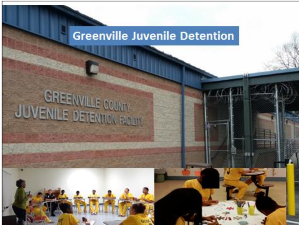
Ministered to over 2800 juveniles in the last 10 years