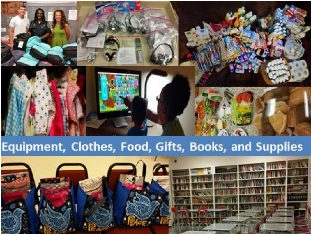
Equipment, Clothes, Food, Gifts, Books, and Supplies

Because of your support, we helped Greenville Juvenile Detention build a library and develop a reading culture. We provide holiday gifts and dinner each year and have donated underwear, clothes, equipment, and hygiene supplies when needed.