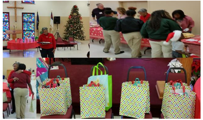
Photo collage from the 2016 Christmas Party